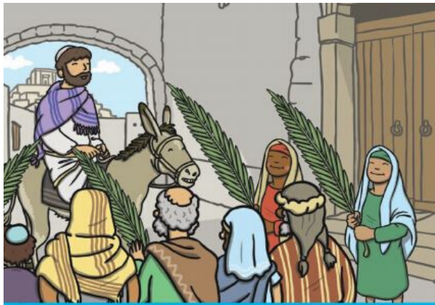
Jesus enters Jerusalem on Palm Sunday